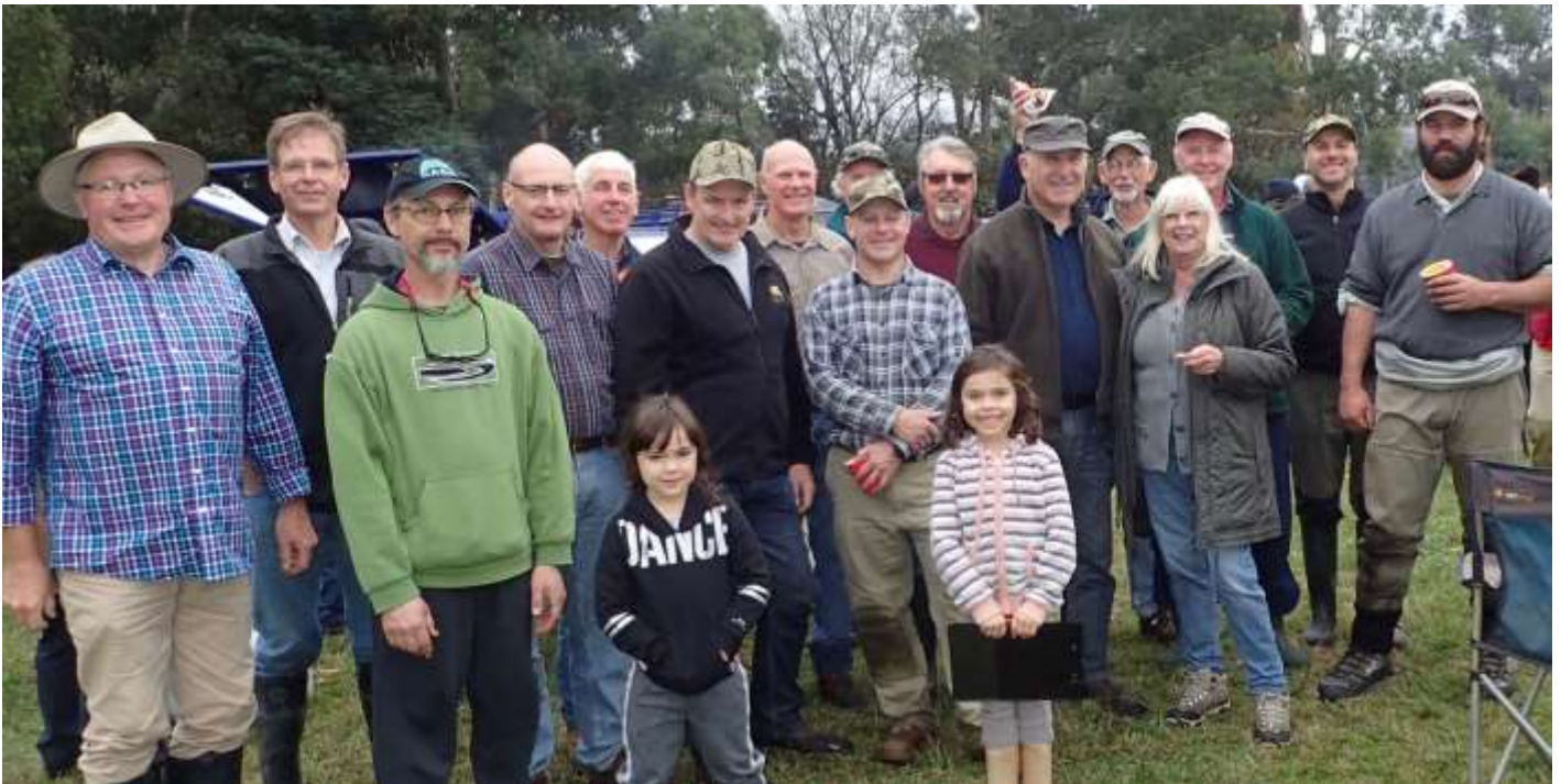
The crew from SFF on the tree planting day

The Steavenson River Tree Planting was a huge success, with a fantastic turnout. While SFF had the largest number of people, there were many others from a variety of groups and organisations represented.