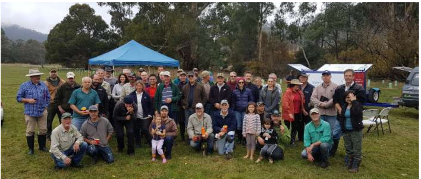
Group shot of everyone who attended the activity

With so many people in attendance, the quota of 600 trees was completed before 12 noon, leaving the rest of the day free.