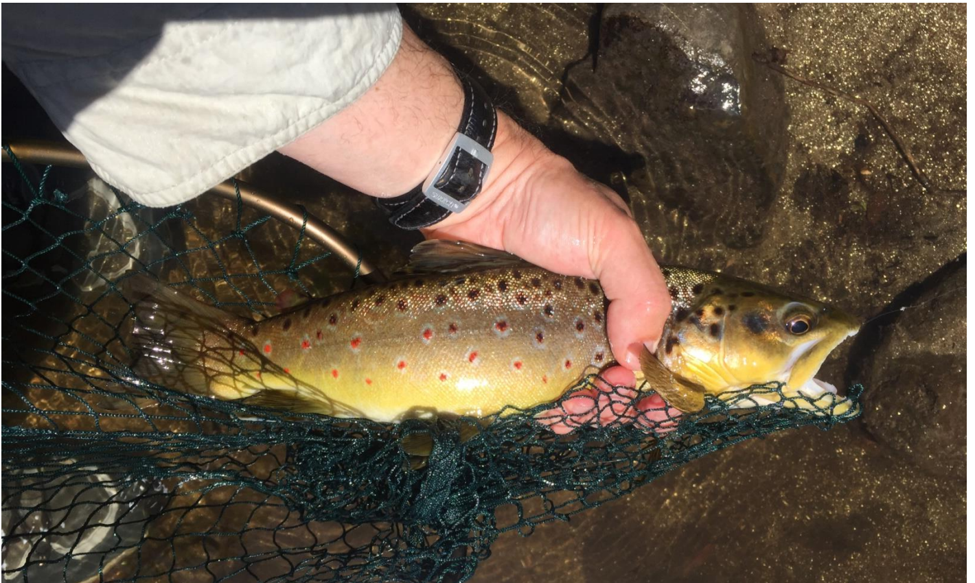
Graeme Renfrey picks up a nice 1 pound brown in Noojee