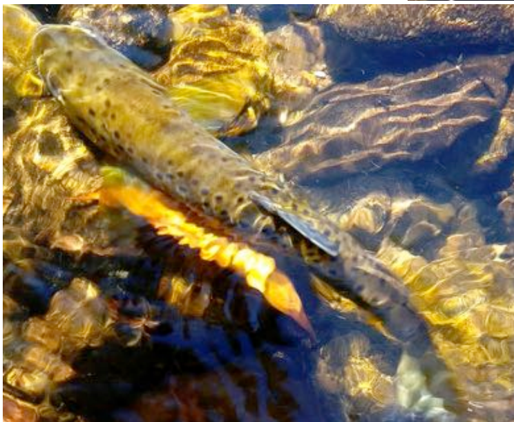
A beautiful looking brown trout caught on the Rubicon by Flo Le Bec.