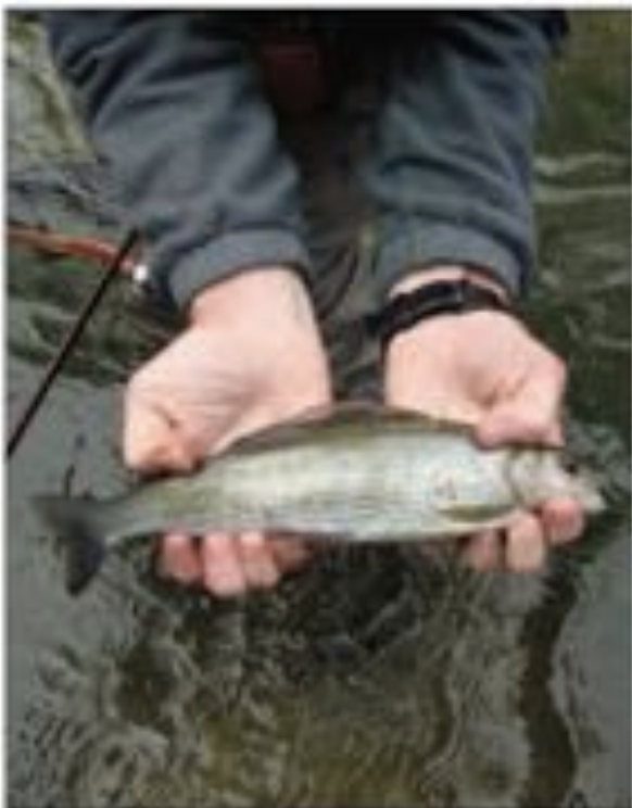
...and caught some grayling as well as trout'