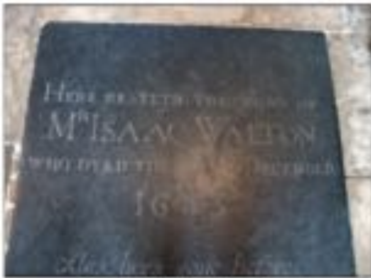
Isaac Walton burial plaque